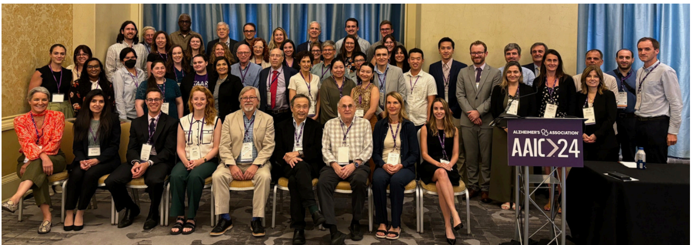
Member of the MGH FTD Unit gathered with researchers from across the U.S. at the LEADS Investigator Meeting where they made plans for the next phase of the LEADS Study, including the addition of international site locations

dementias. From basic science to dementia care, every aspect of the field's growing knowledge of dementia is incorporated into this world-class conference.